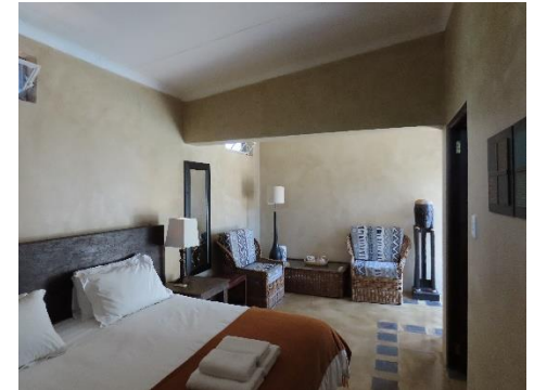
DOUBLE ROOM #6