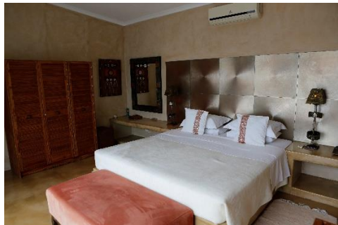
KING ROOM #1