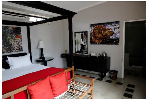
KING ROOM #2