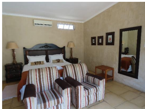
KING ROOM #4